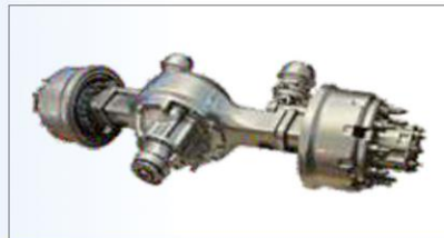
World Class Meritor MS 13-145 Rear Axle