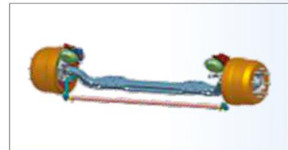
Heavy Duty Front Axle

Proven and reliable high capacity 6S transmission