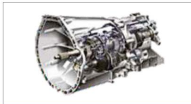
Tata G750 Gearbox

Proven and reliable high capacity 6S transmission